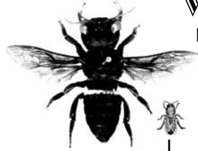
Size of a Honey Bee

Wallace's giant bee, first discovered in 1859 on three remote islands in Indonesia, has been a particularly elusive bee. Long thought extinct, it was not seen again until 1984, 125 years later. Now for the first time a film crew has filmed it alive in the wild.